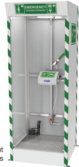
30181 shown without strip screens

Designed for locations where space is at a premium or the shower needs to be enclosed, this emergency combination shower includes an integral drain sump and strip screens to reduce the risk of water outside the cubicle area. Includes interior mounted, ANSI compliant eye/face wash with cover. Shower and eyes/face wash are hand activated. Upgrade to model number 30181 to add a 120V sump pump, suitable for non-hazardous locations.