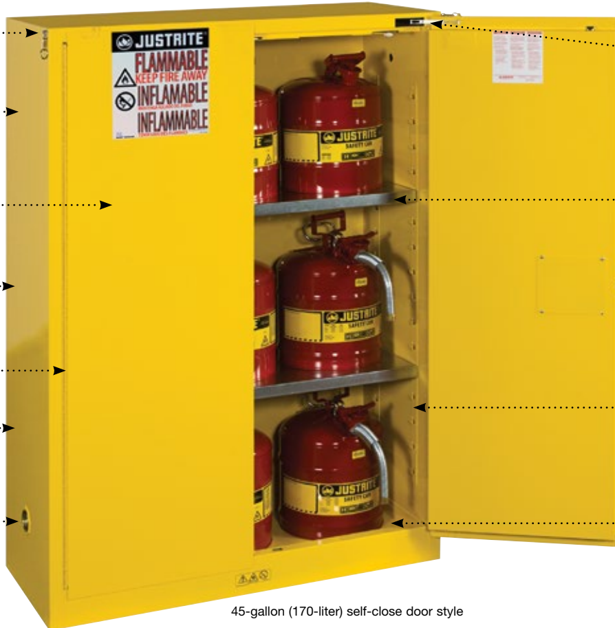
45-gallon (170-liter) self-close door style

Dual vents with built-in flash arresters strategically placed at bottom and opposite top.