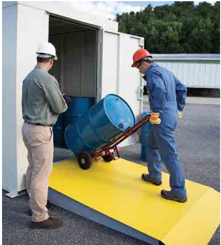
Sixteen-drum locker with optional steel ramp simplifies drum loading.