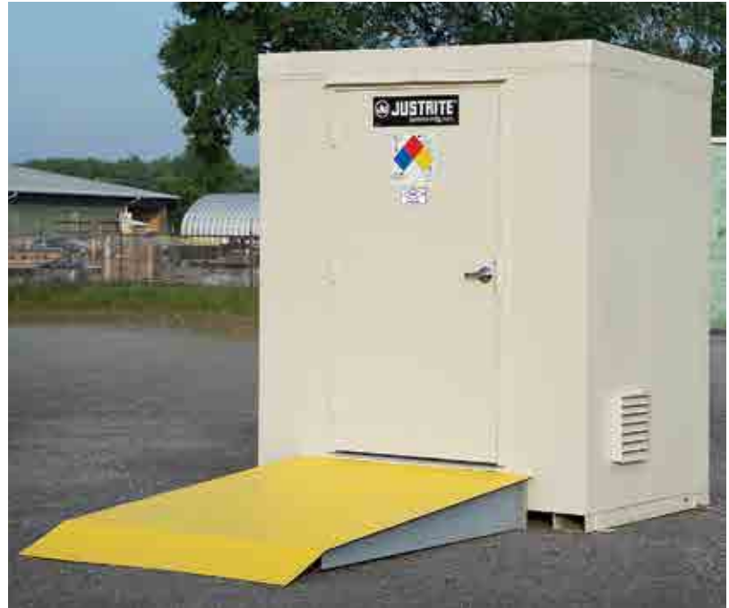
Six-drum locker with optional ramp offers a convenient way to load or unload heavy drums using a drum dolly.