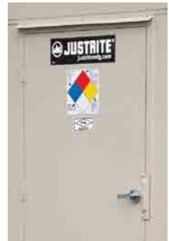
Independently tested and approved 90-minute fire-rated door