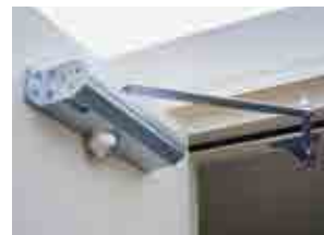
Hydraulic door closer