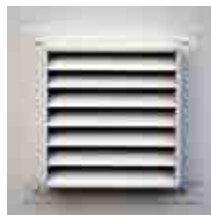
UL Listed air flow vent