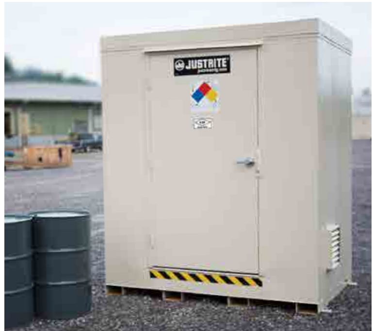
Designed for close placement to existing structures, 4-hr fire-rated lockers provide a safe and convenient storage solution.