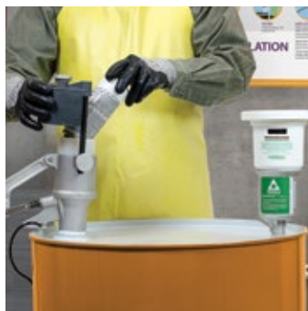
Aerosol Can Recycling