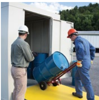
Outdoor Storage Lockers