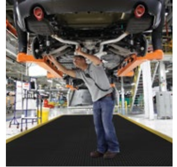
Industrial Safety Matting