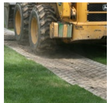
Ground Protection Matting