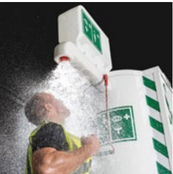
Emergency Eye/Face Wash & Safety Showers