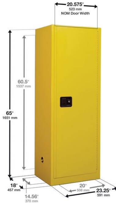
Interior Dimensions Exterior Dimensions